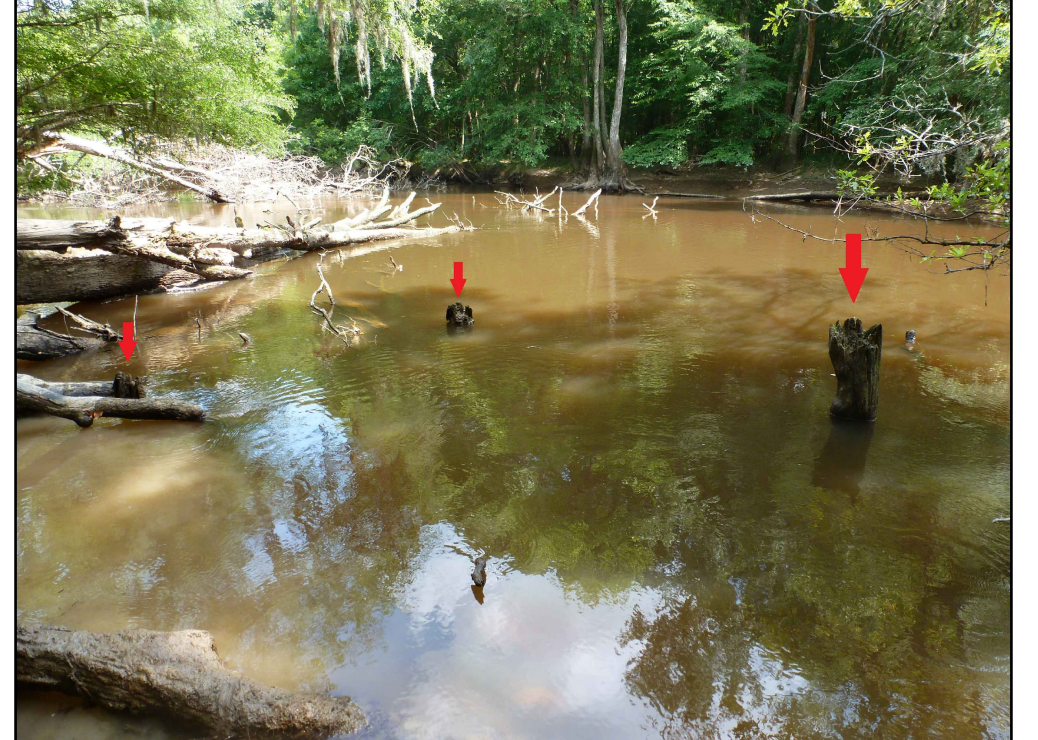
Bridge Supports on the Lynch River

NOTES: 1) Roads and statutory landmarks were positioned by various methods including use of South Carolina's RTN and a GPS rover, conventional surveying methodology, map compilation, historical aerial photography overlay, and GIS layers. Other jurisdictional boundaries shown are approximate and were not surveyed as part of this project. 2) Northing (N) and Easting (E) Coordinates, bearings, and distances, shown hereon, are referenced to the South Carolina State Plane Coordinate System 83/2011 Adjustment and have not been scaled to Ground. 3) For more information visit the South Carolina Geodetic Survey's website at http://rfa.sc.gov/geodetic/cb_projectlist/???????? . 4) The purpose of this plat is to map a section of the Darlington-Florence County Line. It is not intended nor should it be construed to be a boundary survey or boundary plat of the property parcels adjacent to or near the aforementioned county line. The Darlington-Florence County Line and boundary lines of the adjoining properties may be congruent if and only if so specified by the South Carolina Legislative Act(s) that establish and describe or define the county line as it is being plotted hereon. However, in no way is this survey or plat of this portion of the Darlington-Florence County Line giving warranty to the title property boundaries of the adjacent parcels being shown or referenced hereon.