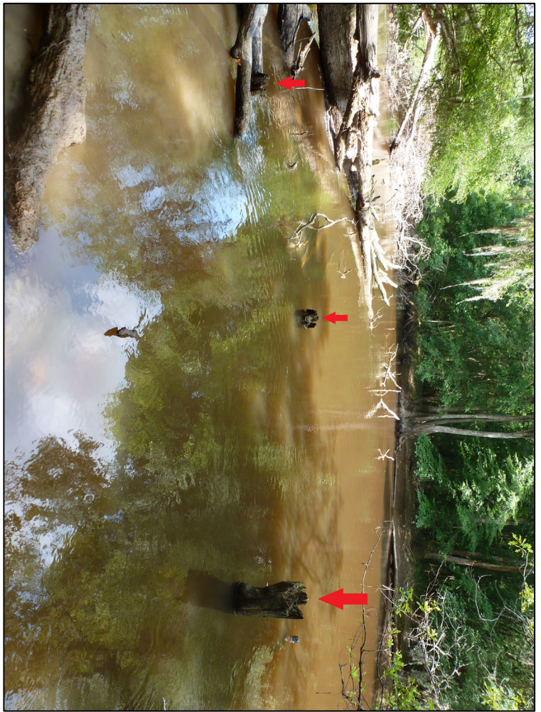
Bridge Supports on the Lynchers River